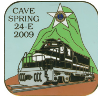
PTCV 2010 Pin

Dues are only $7.50 per year which makes it easy to write a rounded dollar check if 2, 4, 6-years are paid at one time!