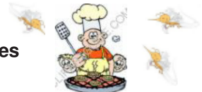
July 4 th

In this instance, there were two separate pins and the manufacturer indicated that it would cost $140 ($70 for each pin) to make the changes desired. At this point, the organization called a friend that called in a lot of "favors" to get that charge cut in half. Were it not for this intervention, the entire proposal would probably have gone down the drain because a charge would simply be too great for the organization to absorb. Even $70 is too much for a non-profit organization to absorb. Bottomline is this could have been avoided IF there had been proper organization review of the Artwork PRIOR to having the samples made.