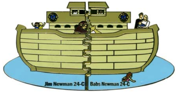
FYI, this is the 2 pin puzzle set.