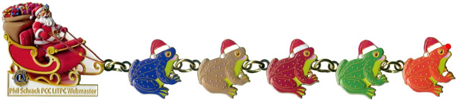
PP 2706 19