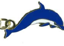
PP 2728 19