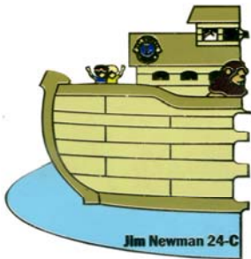
PP 2724 19 Jim Newman (Z) "Newman's Ark" Left Half of a 2 pin puzzle set.