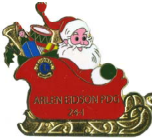
PP 2726 19