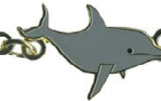
PP 2729 19