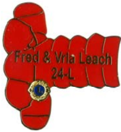
PP 2715 19 Fred & Vrla Leach (L) Lobster Tail