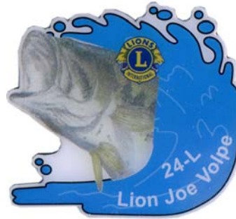
WW 2734 19 Joe Volpe (L) Largemouth Bass