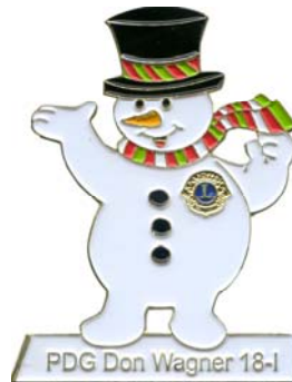
Don Wagner (GA) has the snowman in the 3 pin puzzle set.