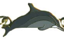
PP 2727 19