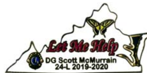
PP 2722 19 Scott McMurrain (L) DG 2019-20