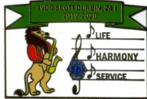
PP 2721 19 Scott Durbin (I) 1st VDG 2019-20

NOTE: This is the 3rd pin in an eventual 5 pin set.