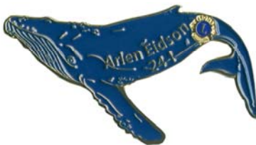
PP 2732 19 Arlen Eidson (I) Humpback Whale