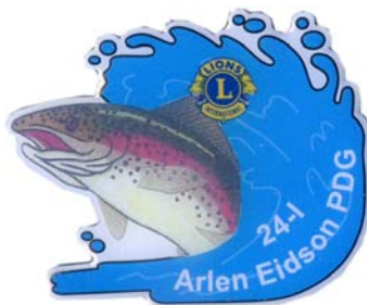
PP 2733 19 Arlen Eidson (I) Rainbow Trout